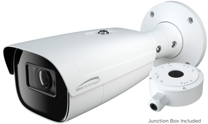
Junction Box Included

**With Compatible Speco NR Series Recorder