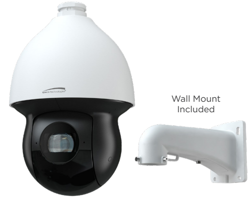
Wall Mount Included