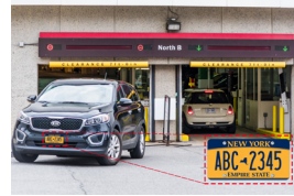
Capture & Recognize Vehicle Plates