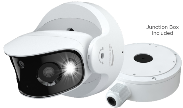
Junction Box Included