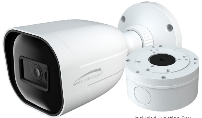
Included Junction Box