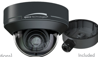
Included Junction Box