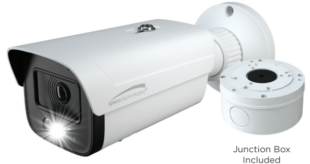
Junction Box Included

**Products are in compliance with NDAA Section 889 Part B Guidelines