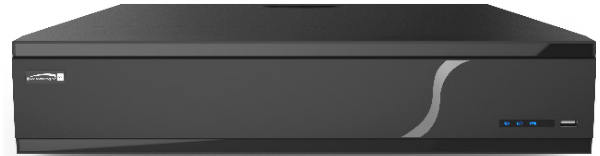
Front View N64NR

Access your NR and HR Series Recorder to view and playback videos from your camera.